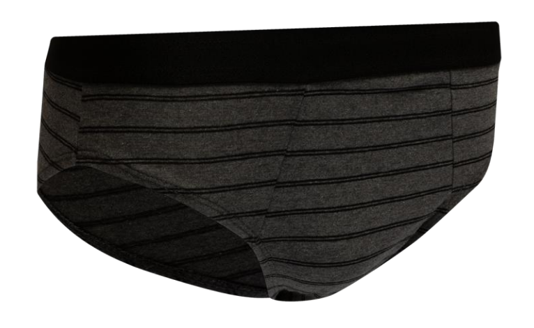
Family boxer briefs Slips