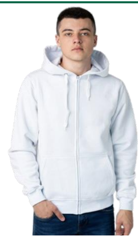
*also has a zipper